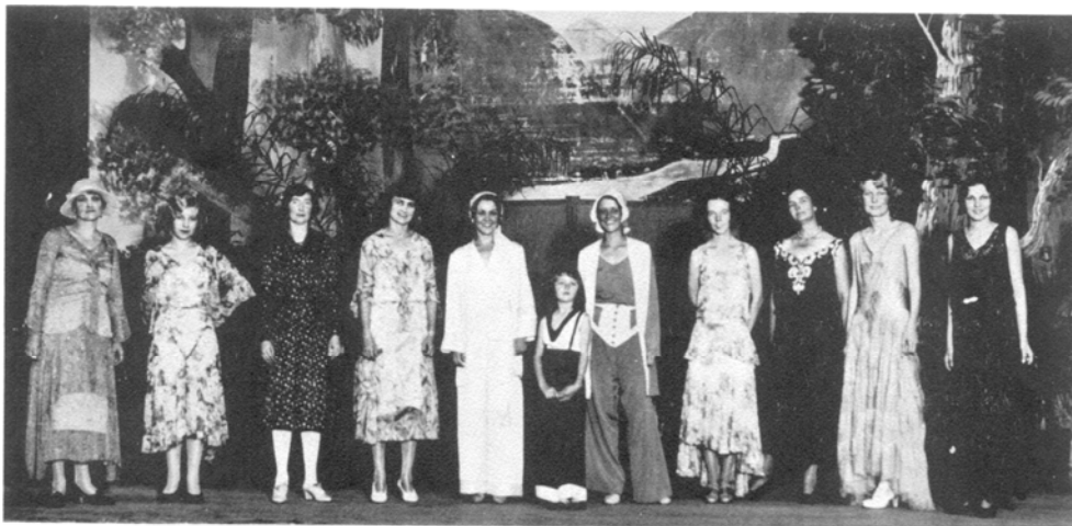
Florida 4-H Fashion Revue of years past

This tradition in 4-H is well-loved and long-standing, and not only is it interesting, but important, to know a little bit about the history of the Fashion Revue, why we do it, and what skills can be learned from participating in this fun and exciting event.